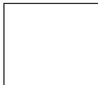
Entry Door/Shutter Color